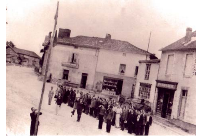
Picture: The 643 rd GTE takes attendance, Oradour-sur-Glane town square.

The 643 rd Foreign Workers Group (Groupe de Travailleurs Étrangers, GTE)